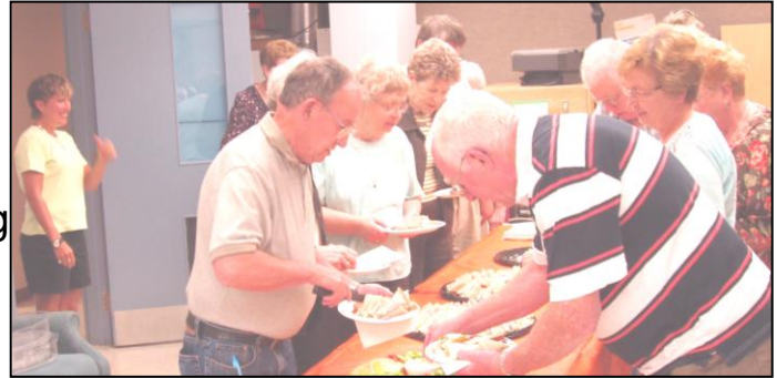
A few of the Reps sampling the lunch kindly provided by The Court at Barrhaven

ANNUAL GENERAL MEETING AND OPEN HOUSE - Our Annual General Meeting and Open House took place on Monday, October 3 rd . Perhaps in part due to the drizzly weather, there were only about 200 Members and potential Members at the Open House, rather than the usual 300 or more. Only a small portion of that number was at the AGM itself. There were however quite a few other members around the facility, doing other things. Please remember that for the AGM to be legal and, for Members of the Volunteer Board to be nominated, we must have a quorum of Members attending the AGM. We barely made it this time, so please help us out next year by attending the AGM, even if you are a volunteer helping out with other things as well.